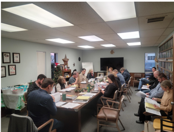
Board Room Before: